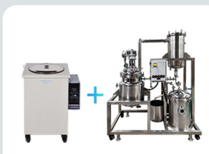
GY-30L + Decarboxylation reactor