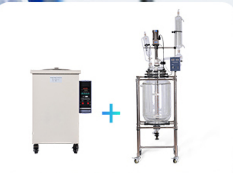
GY-5L + Jacketed Glass Reactor