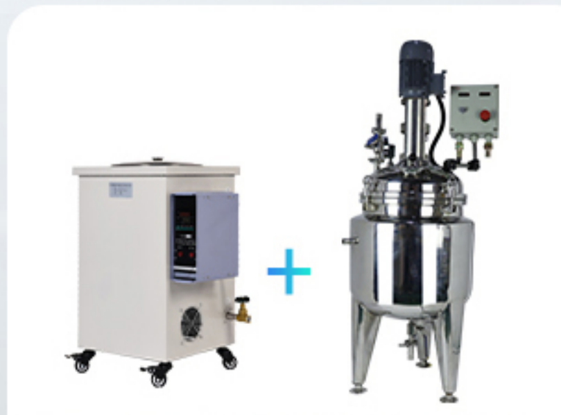
GY-10L + Stainless Steel Reactor