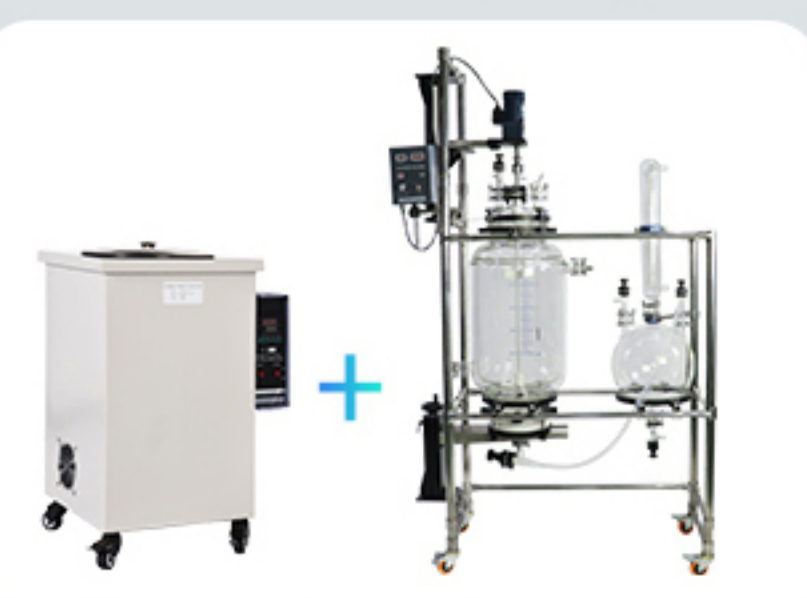
GY-20L + Crystallization reactor