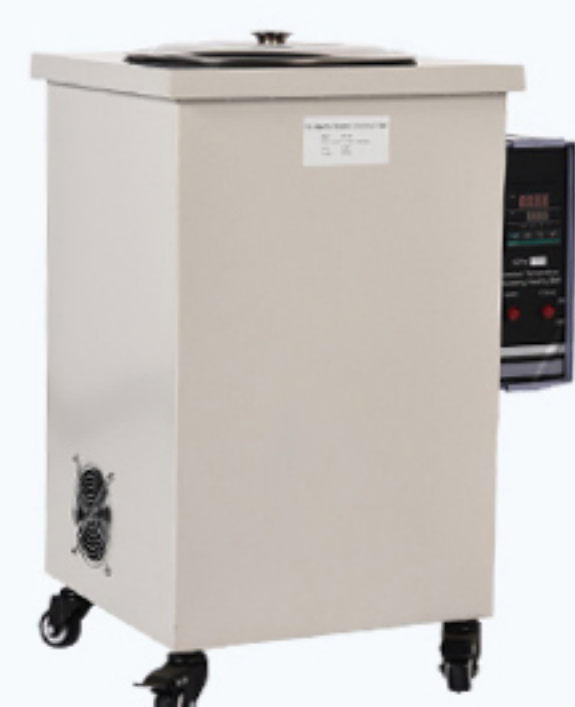
Circulating Water/Oil Bath